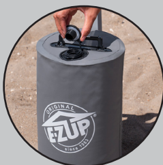
E-Z Twist Cap