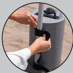
Quick Attachment Straps