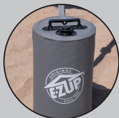
Ergonomic Top Handle

Secure your E-Z UP® shelter from wind and the hustle and bustle of events with our Water Weight Bags. Sold as a 4-pack, each Water Weight Bag holds 2.5 gallons of water to reinforce your shelter at the base of each leg. Compatible with all E-Z UP® shelters.